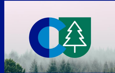
FORESTS AND CLIMATE