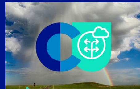
LIVING WITH CHANGING CLIMATE